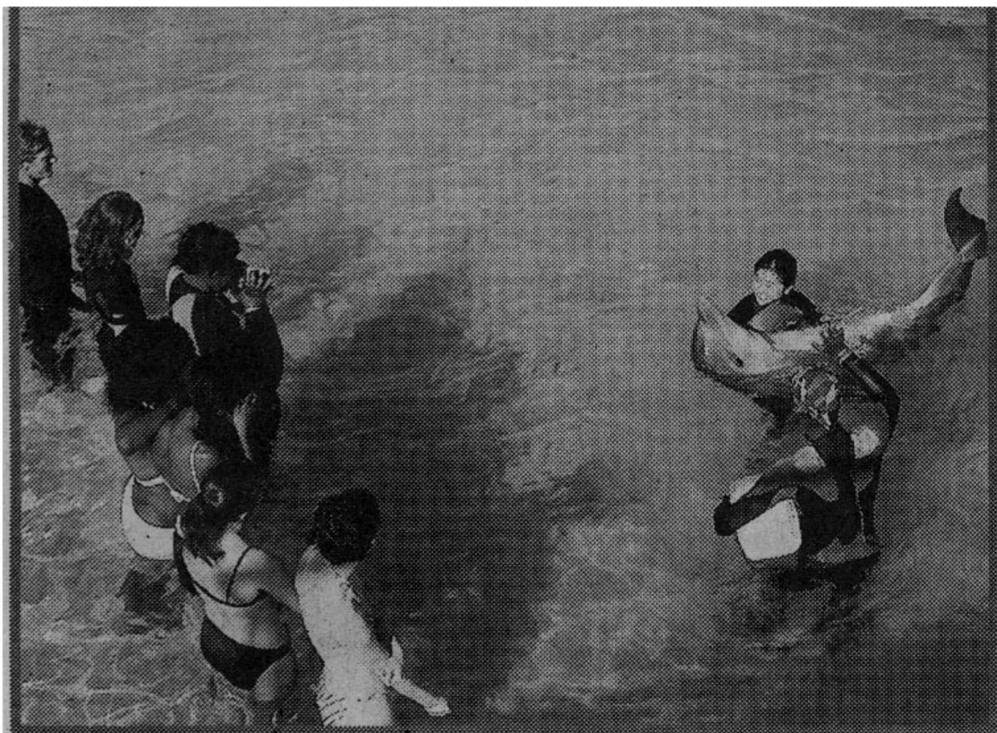
A dolphin trainer instructs a small class.

Extreme Escapes writer Bill Becher can be reached at billbecher@yahoo.com .